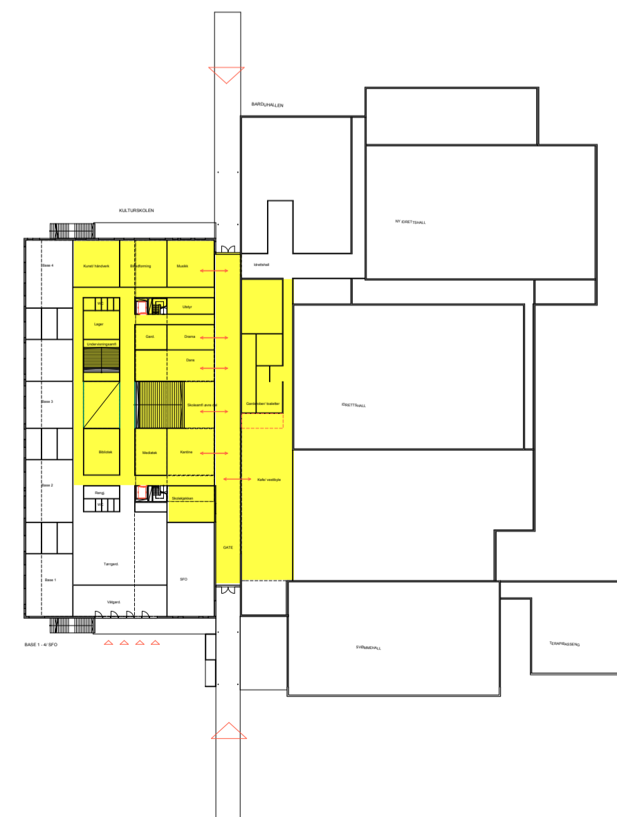
SAMBRUKSAREALER FRITID/ KVELD